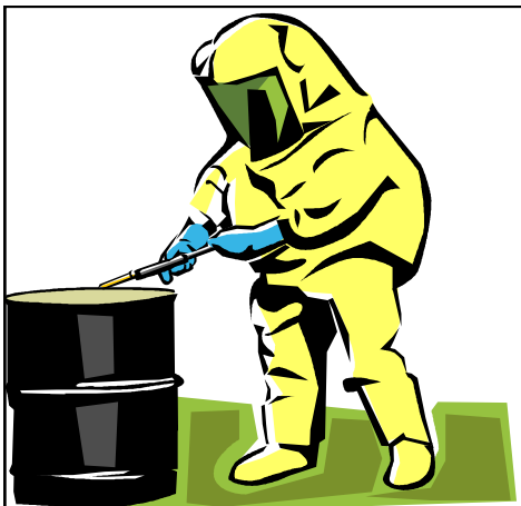
Such pretty colors.

It's not just children either. Adults have also reported adverse reactions to food dye, which isn't that surprising considering how prevalent dyes and additives have become. Caffeine and sugar can give temporary bursts of energy to adults as well as children. With that in mind, it seems reasonable to conclude that food dye can affect adults in the same way it